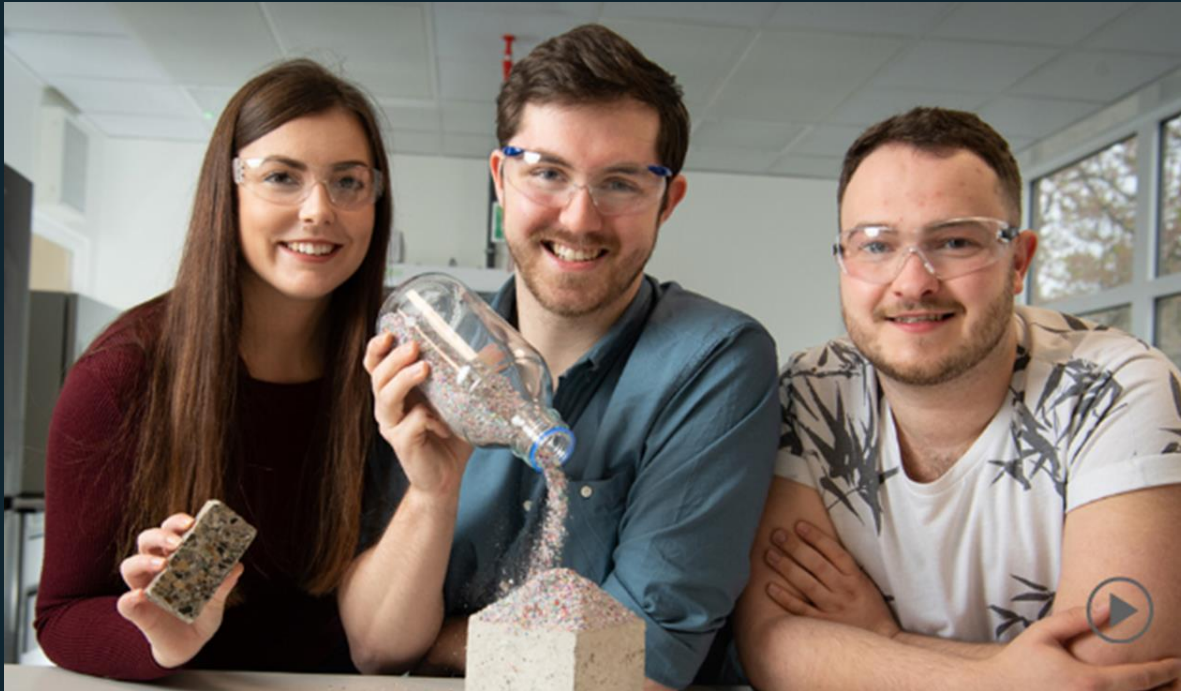
LOW CARBON MATERIALS EARTHSHOT FINALISTS DCI COHORT 1